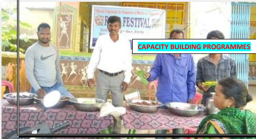
CAPACITY BUILDING PROGRAMMES