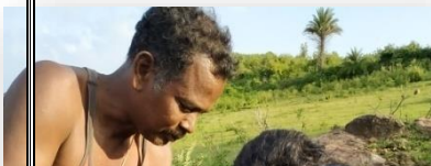
SEED SELECTION PROCESS IN A PARTICIPATORY APPROACH