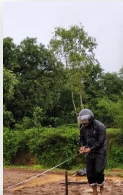
Pest management at field