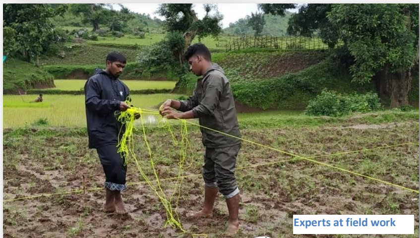
Experts at field work