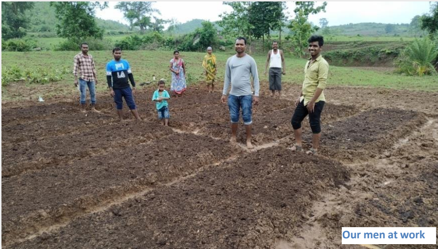
Our men at work