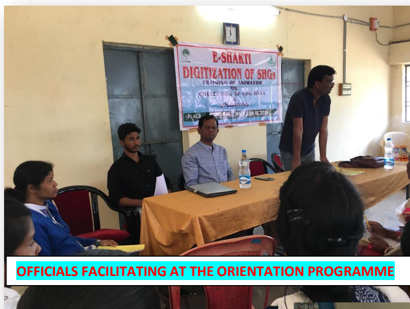
OFFICIALS FACILITATING AT THE ORIENTATION PROGRAMME