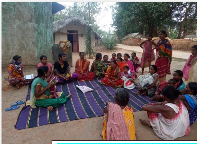
ANIMATORS FACILITATING AT THE GRASS ROOT LEVEL