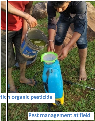
Application organic pesticide