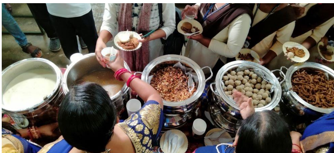
Value added products from Millets being popularised